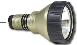
Monostar P7 H 900 lumen