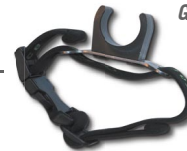
Goodman handle Soft