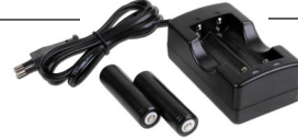
Rechargeable Li-Ion 18650 batteries