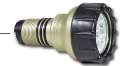
Heptastar XPG H** 1.960 lumen