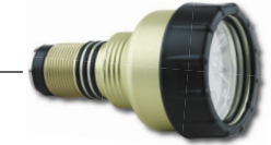
Tristar P4 H 780 lumen